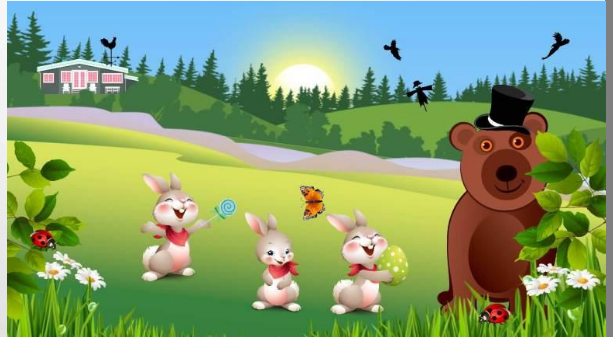
EASTER BUNNIES 2

Answers to the hidden words puzzle in our January edition were: BOOT, CHILL, FROST, ICE, MITTENS, SNOW. How did you do?