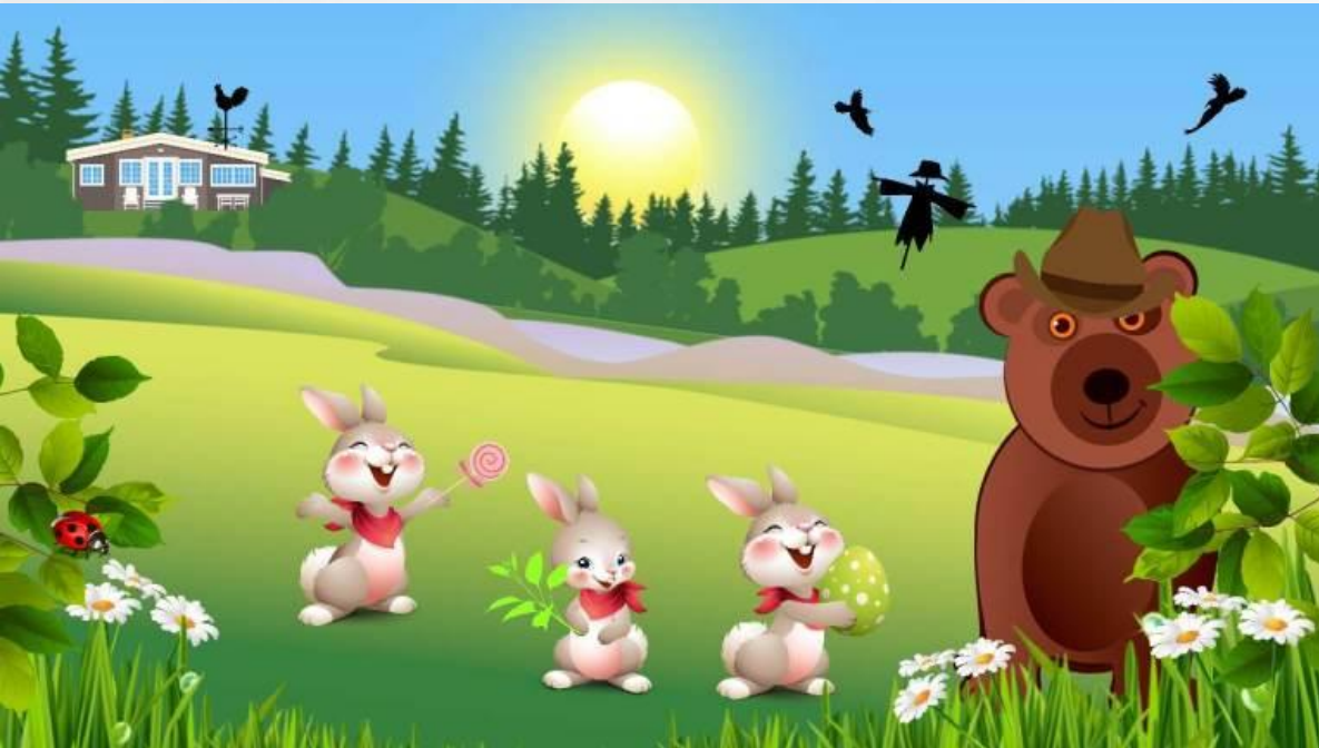
EASTER BUNNIES 1

Look carefully as some are easy to miss. We'll reveal the answers in our next newsletter. Good luck!