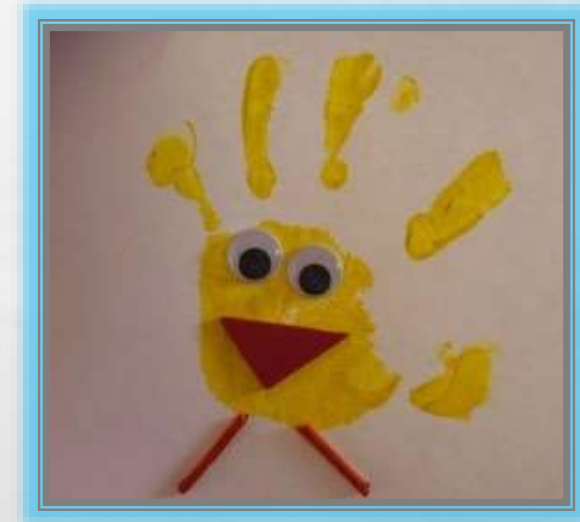
Rose, age 2