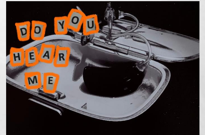
'Do you hear me?' (A4 photo with collaged and digital elements) – Alfie Fox.