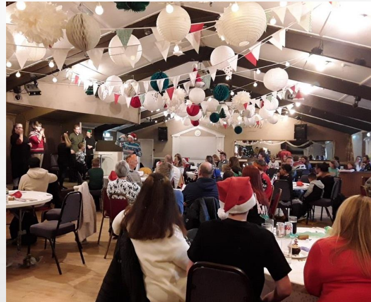
Twelve Days of Christmas Sing & Sign finale with 'I Can Play' – click on the link to watch the video.