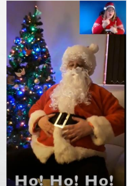
Special message from Father Christmas