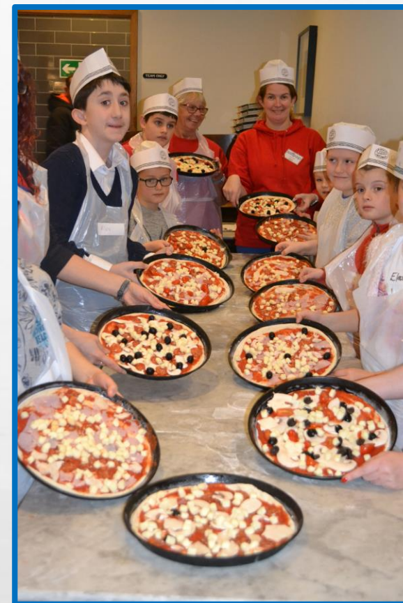
Harrogate Pizza Party – Nov 2018

* If your child has any food allergies the chefs will recreate their pizza with uncontaminated ingredients and cook it separately to ensure their safety.