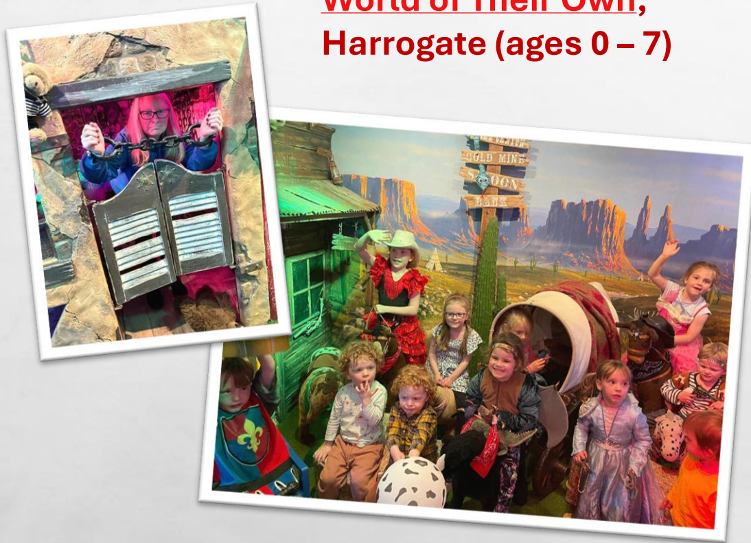
World of Their Own, Harrogate (ages 0 – 7)